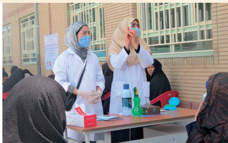
Our dental staff giving hygiene training to the widows

The assignments always have the same pattern: First we put together an aid packages for each family. Our two “COVID-Teams” teach the first two groups and then train them in practical hygiene like washing hands. After that the beneficiaries go to registration to collect their aid packages. In the meantime the dentists and their assistants are also actively involved in teaching hygiene. While learning to wash