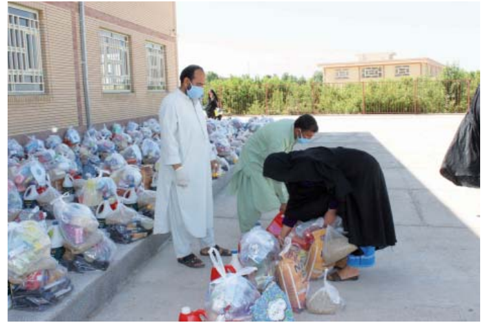
Shelter Now staff during the distribution.

The women were all deeply touched by our practical interest in their lives. They have a real struggle providing for the needs of the family. The Hazara are known as hard workers so it is a great pity when they have no job.